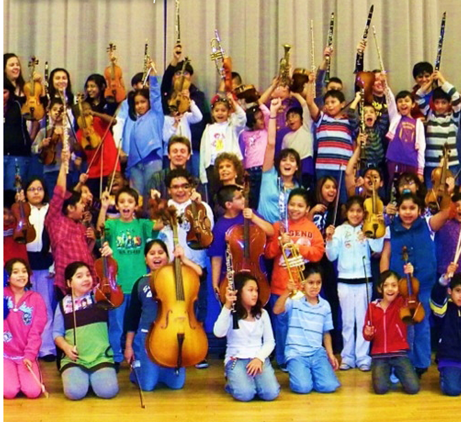
Students of the YOURS Project